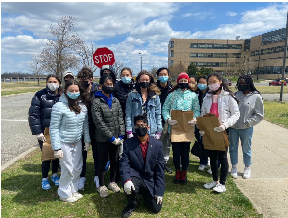
Students from Leon M. Goldstein High School