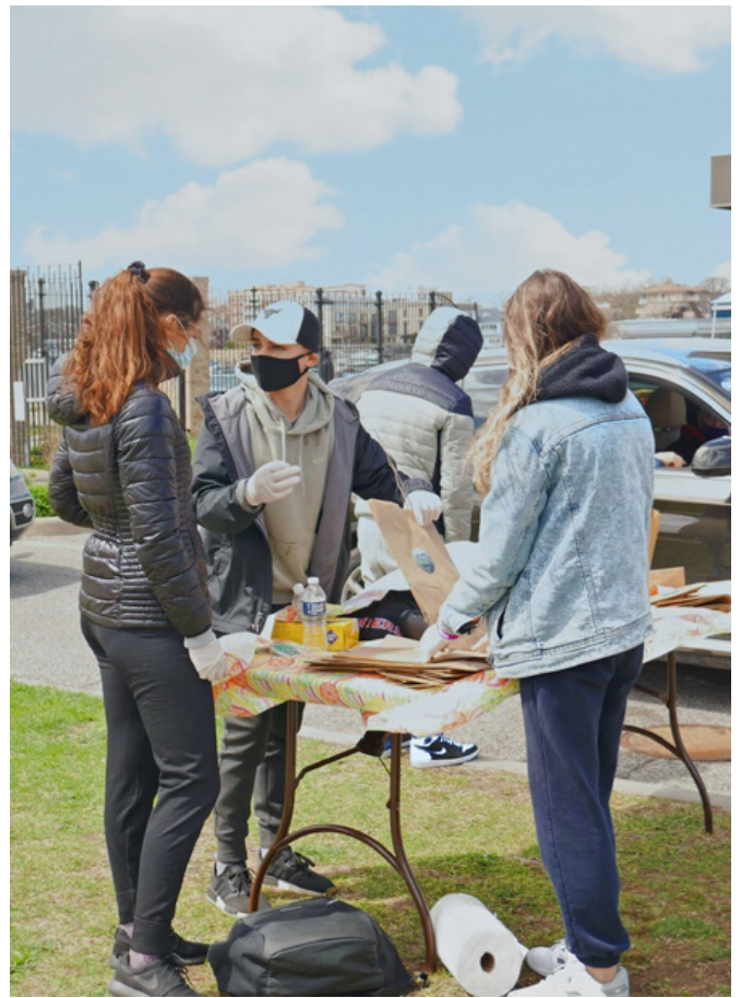
Students from Leon M. Goldstein High School