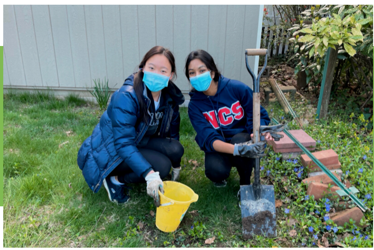
Tree-Plenish Youth Volunteers

We founded Tree-Plenish with the goal of leveraging the power and passion of youth to create sustainable communities. A few years later, our faith in our generation has only strengthened. From our 30 person college team to our over 350 high school event organizers, our organization is run by students for students.