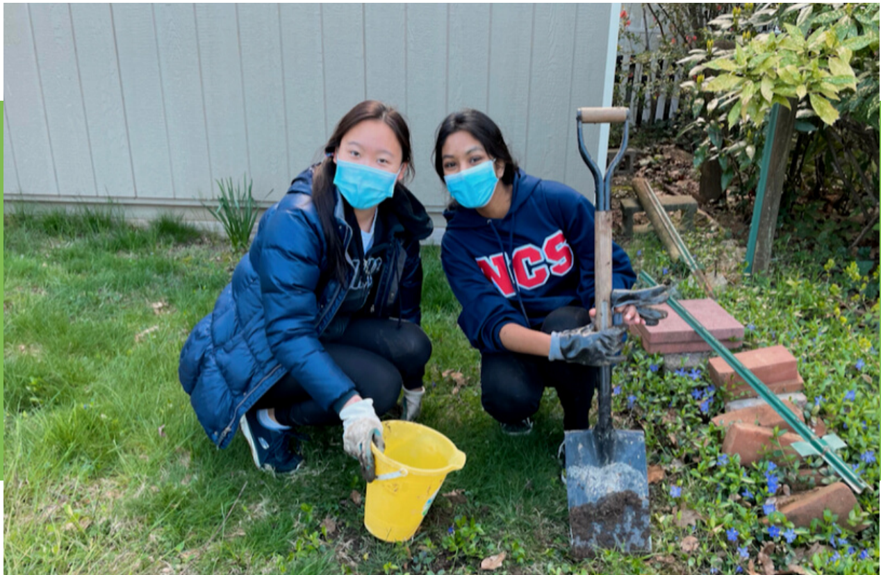
Tree-Plenish Youth Volunteers

We founded Tree-Plenish with the goal of leveraging the power and passion of youth to create sustainable communities. A few years later, our faith in our generation has only strengthened. From our 30 person college team to our over 350 high school event organizers, our organization is run by students for students.